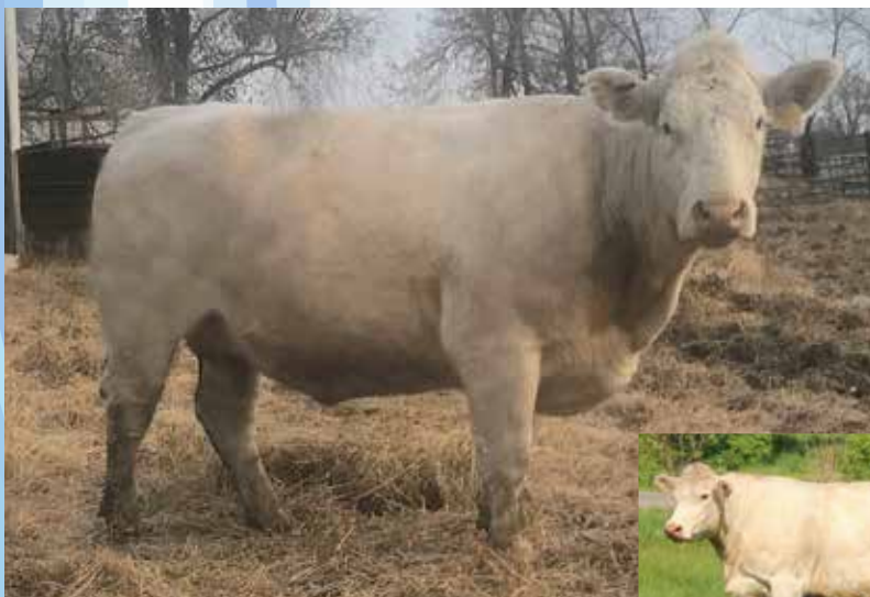
2H SCO SHANNON 601S