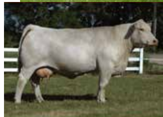
M6 Ms E46's Duke 248 P ET