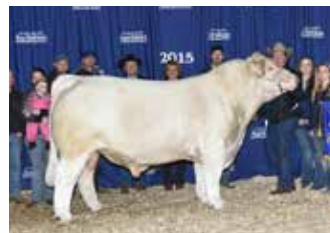
CML Distinction 318A

The next generation and as a 2 year old has everything going for her. With 248, Tipper and Distinction (Canadian National Champion) her pedigree can't be beat. Her first calf is in our show string and is already a proven winner. Dream On has recently calved for the second time and is currently ready to flush. She has 50K genetically enhanced EPDs and is Homozygous polled.