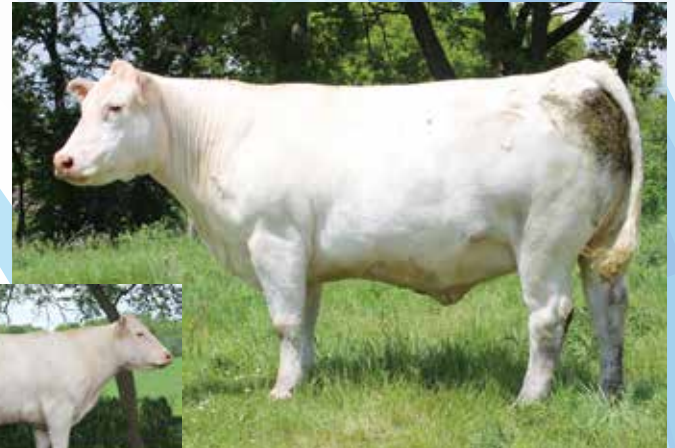
JDJ MS CURLIN X161