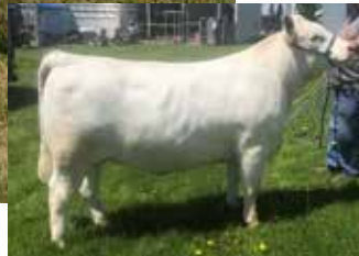
DOUBLE-H BAMBOO 725E